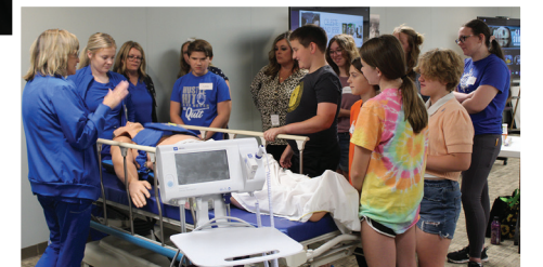
Below: Nursing staff provide demonstration to students.